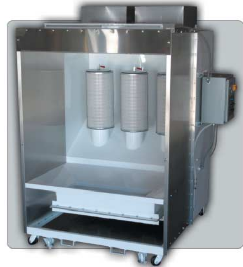
LAB POWDER BOOTH

This feature assures the safe operation of the coatings enclosure, by maintaining the airflow at design levels. During operation overspray powder accumulates on the cartridge filters. As the cartridge filters load, airflow decreases and negative pressure rises within the air handler. A timer activates a system of air purging valves that clear the cartridge filters of accumulated powder to ensure maximum life.